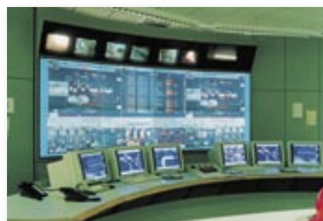
The control room of a waste bunker. If the ThermoVision™ A40 detects a hot spot an alarm will go off.

Although every infrared camera detector pixel measures a temperature value, the m.u.t engineers have chosen a temperature measurement, based on a 3x3 pixel grid. They considered 2x2 pixels as inadequate and uncertain. "3x3 pixel secures additional measurement accuracy and consequently a clearer image contrast, while excluding false alarms", says Volker Meliss, Marketing Director at m.u.t.