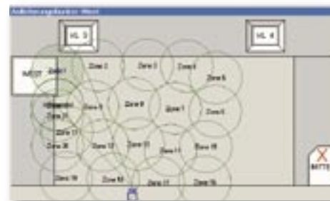
The waste bunker surface is divided in zones. The ThermoVision™ A40 checks every zone subsequently.

The m.u.t. engineers divide the bunker surface in zones which depend on the size of the waste bunker. The camera checks every zone subsequently and its FireWire output provides temperature information and infrared imaging to the crane operator's monitor screen in real-time. The operator is also able to steer the camera from his working place. Three alarm levels marked by visual as well as sound alarms warn the crane operator of substantial temperature differences on the waste surface in a particular zone. The waste is then mixed and turned, transferred to another zone, or carried directly to the oven for combustion.