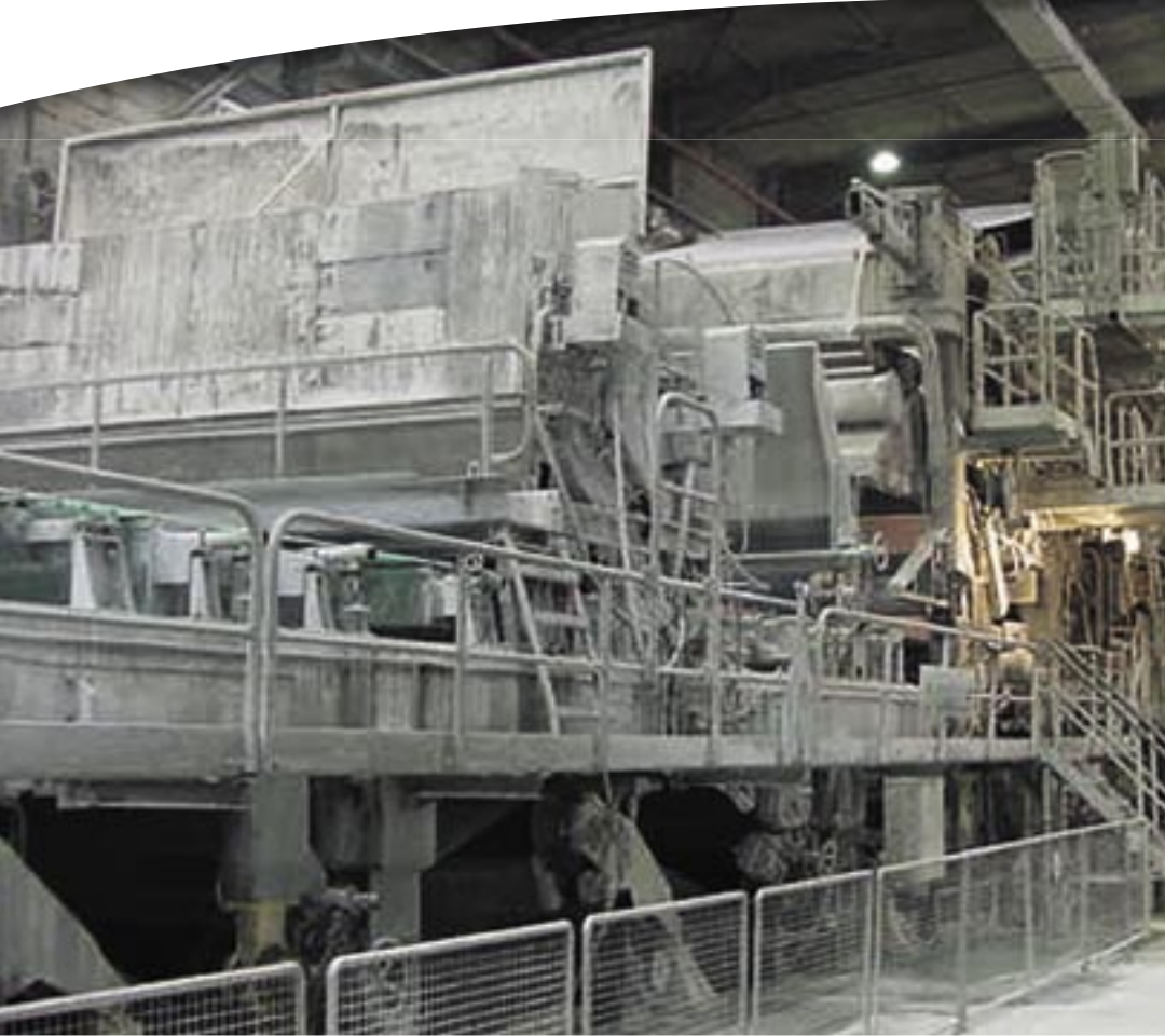
One of the paper machines at the Bessé plant